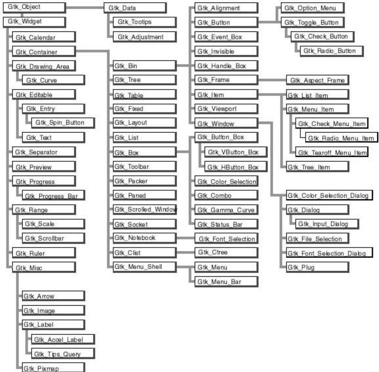
Figure 2.1: Widgets Hierarchy